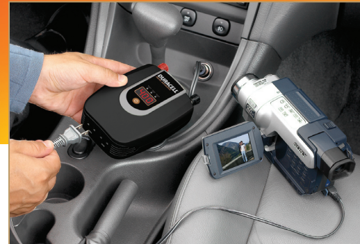
Portable power in your vehicle